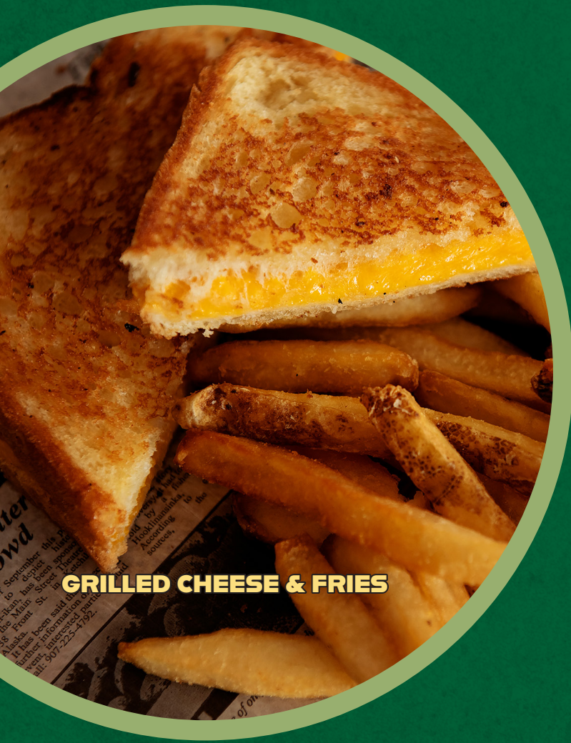
GRILLED CHEESE & FRIES